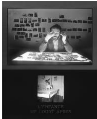
Above: Self-Portrait at Light Table, Montréal, Quebec, 1984.