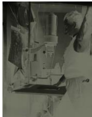
Photographer Makin Girlie Pin-Up Print with Photo Enlarger, c. 1940, 2014 (simulation of the negative). From the series “Gestures and Rituals of the Darkroom” Collection Michel Campeau

Press tour: Friday, July 12, 2019, 11 am