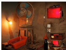
Untitled 7953, Niamey, Niger, 2005–2009. From the series "Darkroom" (2005–2010)