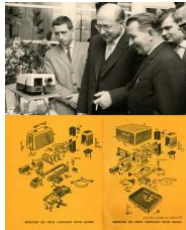
Slide projector and technical manual, c. 1960. Collection Michel Campeau

All image material is to be used solely for editorial coverage of the current exhibition