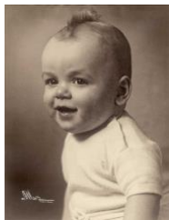
Portrait of a Young child, Studio Saint-Mars, ca. 1950.

Press tour: Friday, July 12, 2019, 11 am