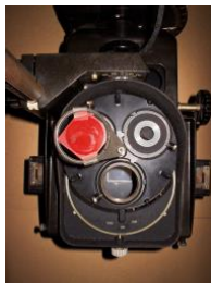
Untitled 1104, Bruxelles, Belgium, 2005–2009. From the series “Darkroom” (2005–2010)

Press tour: Friday, July 12, 2019, 11 am