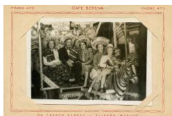
Donkey Cart, Tijuana, Mexico, c. 1955. From the series "The Donkey that Became a Zebra"