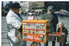
Street Photographer, Copenhagen, Denmark, ca. 1956. From the series "Capital Camera Exchange Inc. – Anonymous Amateurs and Professional" (2015–2018)